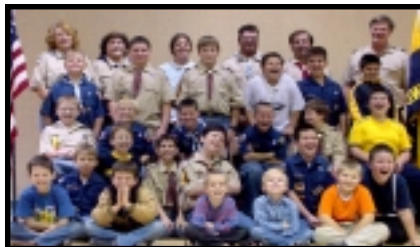
Last Year's Lindsay Cub Scouts